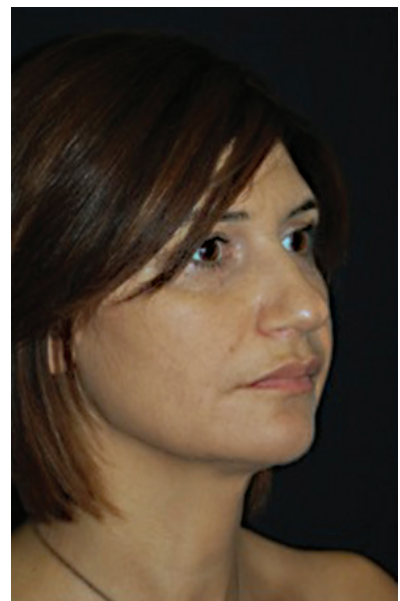
Figure 3: Jaw Line - the 'U' deformity.