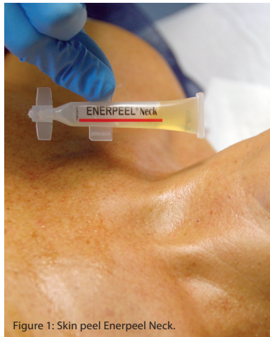
Figure 1: Skin peel Enerpeel Neck.

The second step takes place after two weeks. The use of fillers offers a versatile, non-surgical option for facial augmentation